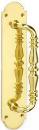
Ornate Pull Handle On Shaped Plate

Dimensions: Other sizes available are below: