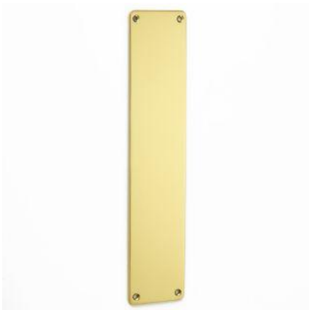
Finger Plate With Rounded Corners

Dimensions: Other sizes available are below: