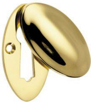
Raised Oval Covered Escutcheon

Please note that illustration sizes are approximations