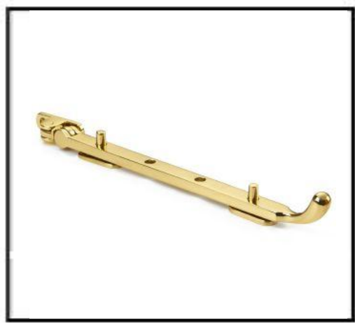
Bulb End Casement Stay 1791

Dimensions: Other sizes available are below: