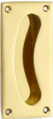
Kidney Cast Flush Pull

Dimensions: Other sizes available are below: