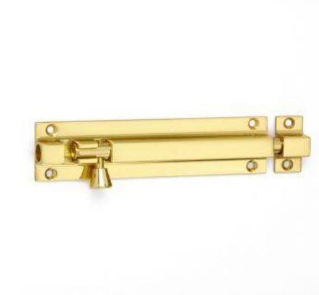
Square Section Barrel Bolt

Please note that illustration sizes are approximations